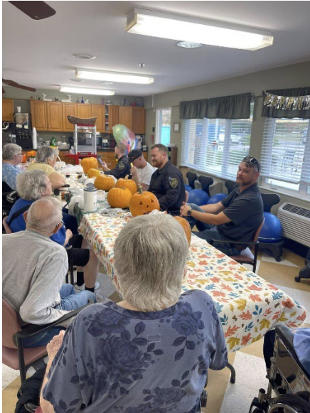
Pumpkin Carving at Village Manor.