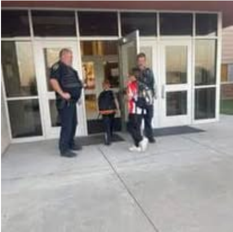
High Five Friday at Eisenhower Elementary School.